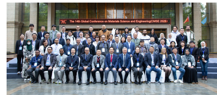
CMSE 2025 in Northwestern Polytechnical University, Xi'an, China

Ruins of St. Paul → A-Ma Temple → Macao Maritime Museum → The Venetian Macao